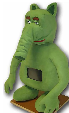
Figure 5. Probo, an intelligent huggable robot for HRI training with children

Emotional partner Probo the Robot (Fig. 5) is a robot assistant who is always ready to listen and support. It helps to overcome fear, insecurity, and other emotions that interfere with learning and development.