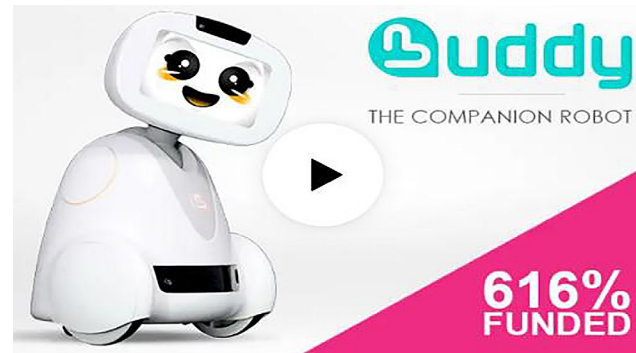
Figure 1. The appearance of Buddy the robot

process. The focus is on the companion robot Buddy (Fig. 1), which has a special purpose to help children (including those with autism) in their learning and development. Thanks to its friendly and accessible form, Buddy promotes the development of social skills, the perception of information, and the understanding of emotions. His interaction with students leads to the creation of an open and friendly educational environment that promotes effective learning and social development of each participant in the educational process.