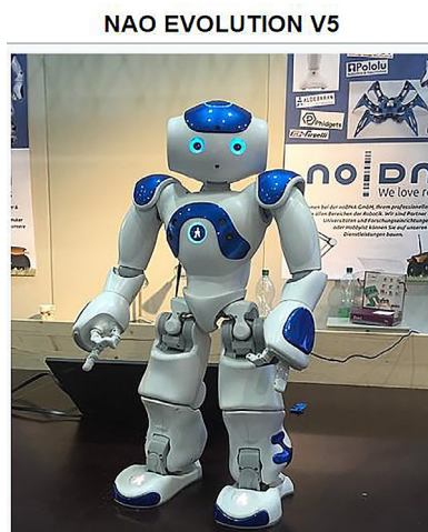
Figure 3. The appearance of Nao the robot

up new opportunities for the development of students from different countries. The introduction of robot teachers into the educational process in the role of a friend, assistant, or partner is a characteristic feature of the European Union countries, which is declared in European standards. Another virtual assistant that helps to learn language and mathematics is Nao Robot (Fig. 3), developed by SoftBank Robotics (n.d.). Not only does it provide instructions and explanations but also tests knowledge, motivates, and supports. It has several functions designed to educate, entertain, and interact with users. Nao has an interactive interface capable of recognising voice commands, faces, and gestures, making it an ideal candidate for use in educational institutions and training programmes. Not only can it help with language and math tasks, but it also helps develop creative skills and engage in social interactions, helping educators and learners in the learning process.